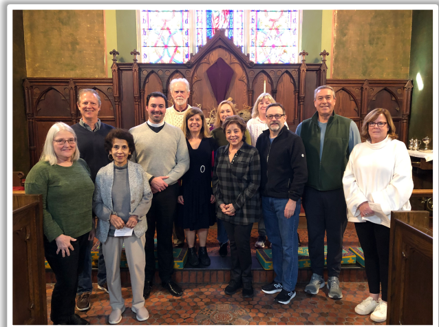
The vestry on retreat at St. Paul's, Dedham, in March 2023.

The Financial Committee, treasurer, and bookkeeper worked with a diocesan consultant to update and refresh the QuickBooks chart of accounts to help with financial reports. With such a busy year, we would like to thank everyone in the parish who helped us during our first year as your wardens. All of those who helped with the year-end party, the barbeque with CHS, our outreach programs, youth programs, worship assistants, and vestry, there are too many to name but you all help make St. John's a warm, welcoming church.